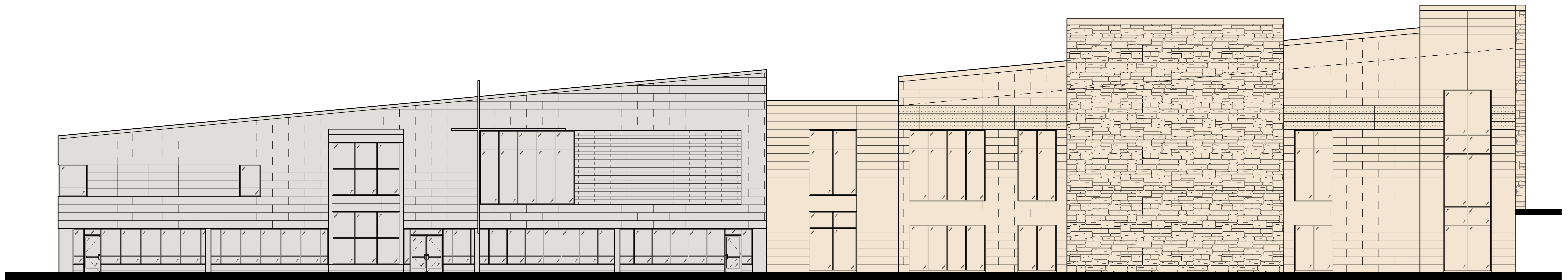
NORTH ELEVATION OPTION B